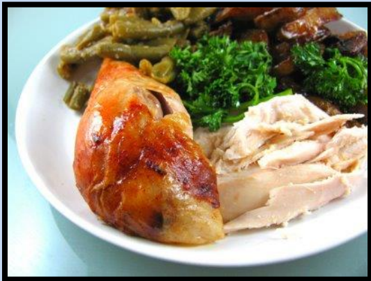
Children & Veggie Meals available